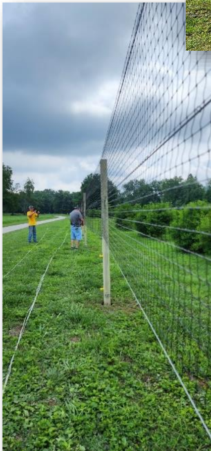
Figure 9. Four feet of plastic mesh fencing added above the 3D electric fence to stop the jumpers. The 3D fence was taken down during this construction.