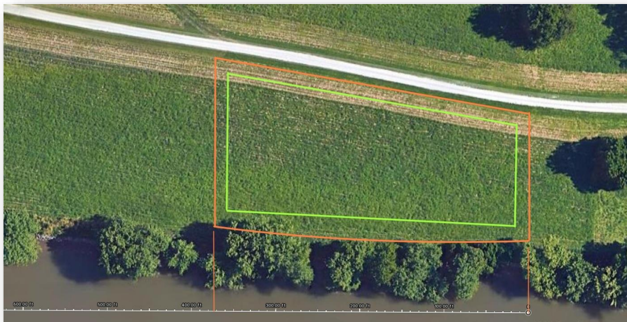
Figure 2. The experimental island planting site, also showing the West Virginia channel of the Ohio River at the bottom. The site’s excellent soil is Huntington loam with a black walnut site index above 100 feet at age 50.

When we approached West Virginia’s Blennerhassett State Park management with the proposition of hosting the experimental planting, the idea was quickly and graciously approved. They helped us choose a site ideal for planting and their educational guided tours (figure 2).