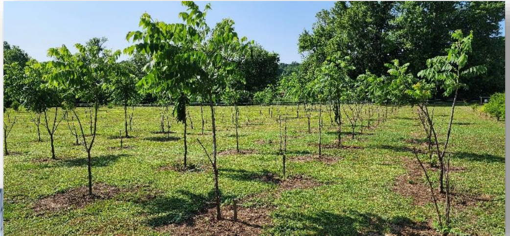
Figure 8. Two-year-old black walnuts defoliated up to a height the deer could reach - - - July 2023.

The 3D deer fence provides an optical bluff to deer. After two and a half years, the island's deer herd called our bluff. They were reported by Park personnel to quickly jump over the 3D fence, which became utterly useless. In a week, they completely defoliated the black walnut as high as they could reach (figure 8). We installed a 7.5-foot fence by adding 4 feet of plastic mesh above the 3D electric fence (figure 9). As of three weeks following the new installation of high fencing, there has been no damage—the deer have withdrawn to plan their next attack.