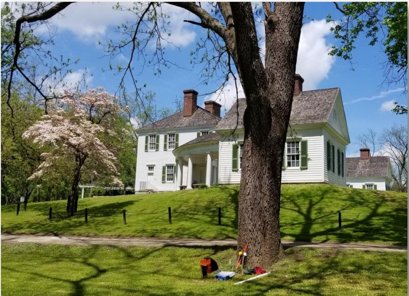
Figure 1. A black walnut tree at the Blennerhassett mansion with tree measuring equipment and a 5-gallon orange pail (for scale)

In the autumn of 2020, a group of dedicated enthusiasts established an experimental planting of black walnuts at Blennerhassett Island Historic State Park. Blennerhassett Park is a special place for existing and wannabe walnut growers because of its rare and impressive 1935 black walnut plantation planted on 2.4 acres adjacent to the historic Blennerhassett mansion (figure 1). With a successful new planting described below, Blennerhassett will be the Mecca of black walnut growers. Everybody will have to see it once in their lifetime. This article describes the project and some early successes and challenges.