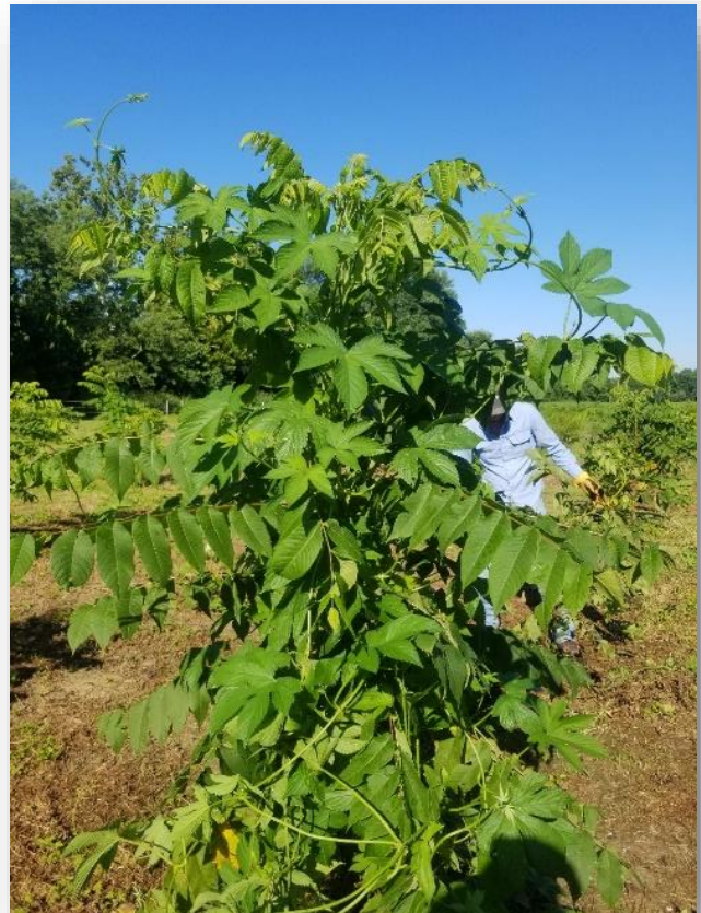
Figure 7. Japanese hops enveloping a 7-foot tall black walnut. These aggressive vines were pulled loose with gloves) and layed out on the ground to be sprayed with herbicide.