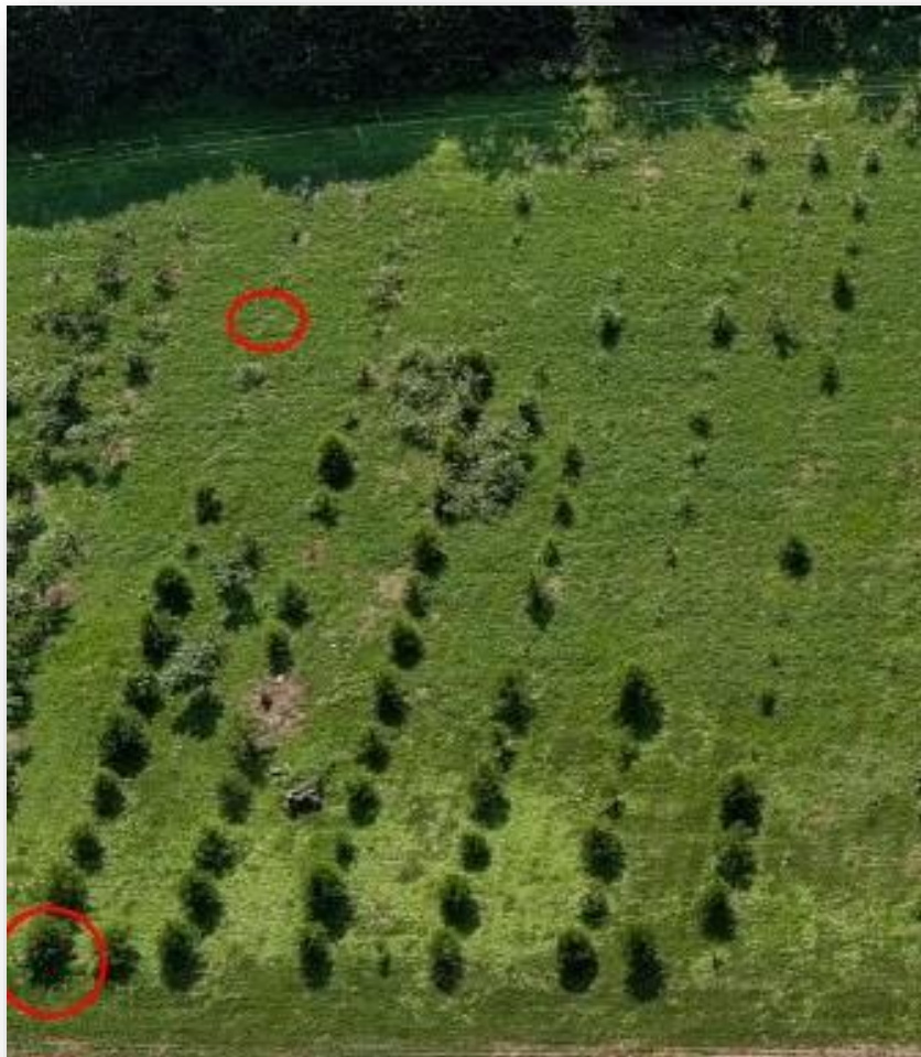
Figure 6. Blocks 3, 4, and 5 of bald cypress trainers, showing the good and bad growing areas (red circles).

The direct cost of the initial planting and 3D deer exclusion fence was $2500, which the Walnut Council Foundation generously provided. The planting is two acres, and the fence is 1500 feet long (figure 5). The Johnson grass proved hard to kill, but multiple applications have reduced its presence in the plantation. The tall fescue has been easier to control. We use a glyphosate-based herbicide and Pendulum pre-emergent herbicide in our weed treatments. High water in the Ohio River, combined with a massive floating tree trunk, took down the 3D fence, and the deer got in and browsed off the new white pine. The deer didn't seem to bother the black walnut or bald cypress trainers. We did notice that there are good and bad growth areas in the plantation (figure 6). Laboratory analyses of typical and minor elements in soil and tissue samples found no apparent differences among these sites, so the differences in growth we see remain a mystery. Despite the poor performance of white pine, both the bed run (wild) black walnut and the improved black walnuts averaged 2.1 feet in height (table 1). The bald cypress was amazing and averaged 3.2 feet by the end of the first growing season. The tallest of 270 black walnut seedlings in the plantation was a bed-run tree that was 4.9 feet tall.