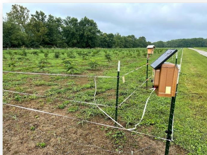
Figure 5. The 3D deer exclusion fence with solar charger worked well for two and a half years, then failed completely.

We quickly recognized that the first chore was to ensure seedling survival. The island site has a lethal stand of invasive Johnson grass and tall fescue. Before planting and over the short course of the establishment phase of this study, we have used various broad-spectrum and preemergent herbicides to control herbaceous competition. We have repulsed the island's sizeable and destructive deer herd with some success using a 3D deer fence.